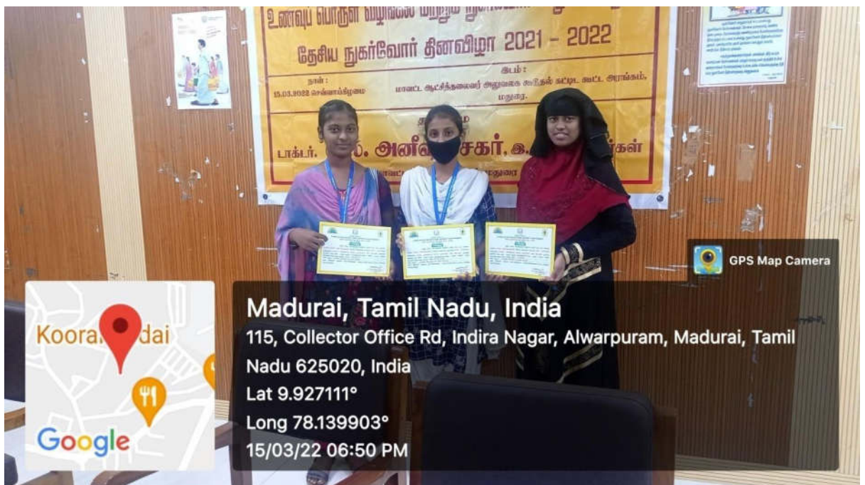
Our students participated in National Consumer Day celebration